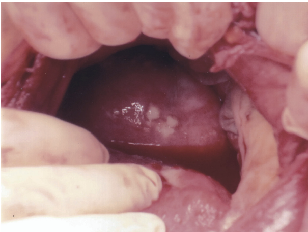
Figure 1. Necrotic peritoneal tissue.