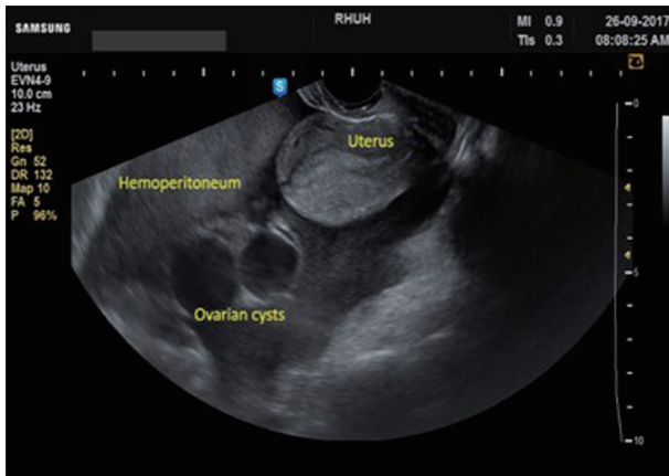
Figure 1. Transvaginal ultrasound at admission showing the massive hemoperitoneum and the two ovarian cysts.