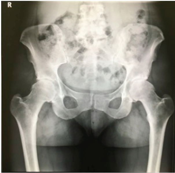
Figure 1. The X-ray image of pelvis, AP view, showing cam-type impingement and moderate osteoarthritis. AP: anteroposterior.

arthritis (Fig. 1). Magnetic resonance imaging (MRI) without contrast of her pelvis and right thigh showed an acute avulsion of the right proximal hamstring conjoint tendon, with distal retraction by approximately 6 cm. MRI also revealed a 4.6 \times 3.6 \times 10.7 cm intramuscular hematoma in the hamstring and bilateral mild hip arthritis (Figs. 2, 3).