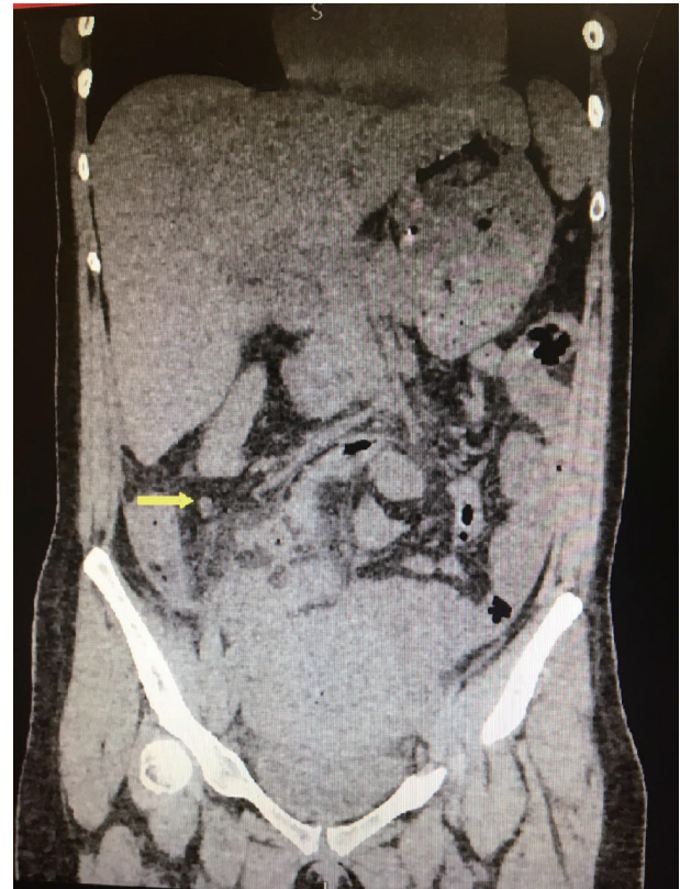
Figure 3. Formation in recto-uterine pouch (arrow).

Using minimally invasive approach abdominal and pelvic cavity were explored. Massive pus and fibrin deposits were visualized between the intestines, on uterus and in recto-uterine pouch. Gangrenous appendix was visualized with tissue necrosis signs and perforation on basal part. General surgeon